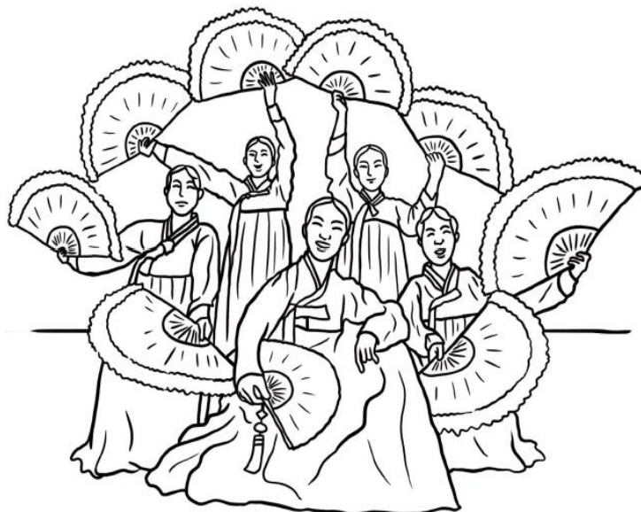
Buchaechum is a fan dance of Korea, usually danced by groups of women who wear traditional clothing, called hanbok. Their dresses and fans are brightly colored and show off their fluid movements and formations.